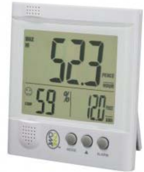
Open Eco Show Homes